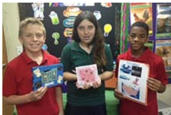
The 6th graders "adopted" an element from the periodic table and created a baby book about their new bundle of joy!