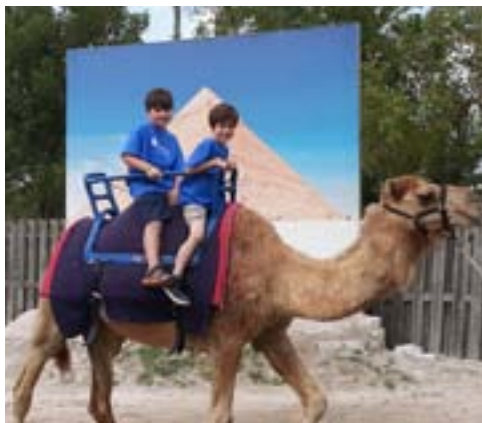
Guess what day it is? Above: It's a great day for our Kindergarten kids to visit Lion Country Safari! Left: K5ers celebrate Dr. Seuss' Birthday with a special snack! What fun!