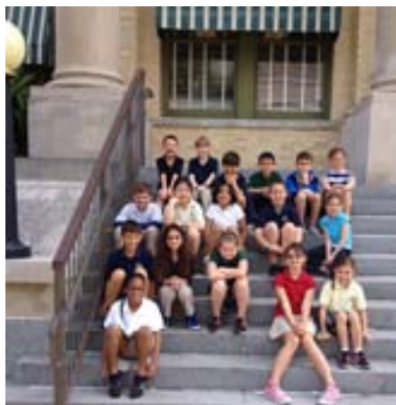
Our 3rd grade learned a great deal about our county when they visited the Richard and Pat Johnson Palm Beach County History Museum.