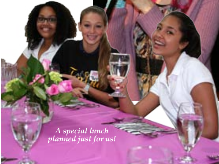
A special lunch planned just for us!