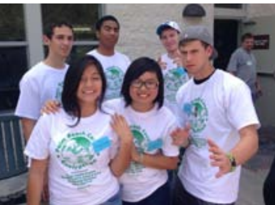
On Friday, February 21st, a team of six seniors represented ACA for the first time in the Palm Beach County Envirothon held at the Arthur R. Marshall Loxahatchee National Wildlife Refuge. They competed against other Palm Beach County Schools in the areas of soils, aquatics, forestry, wildlife, sustainable farming, and the Lake Worth Lagoon. "The King Crabs" represented our school well and gained a wealth of knowledge about ecosystems and our environment.