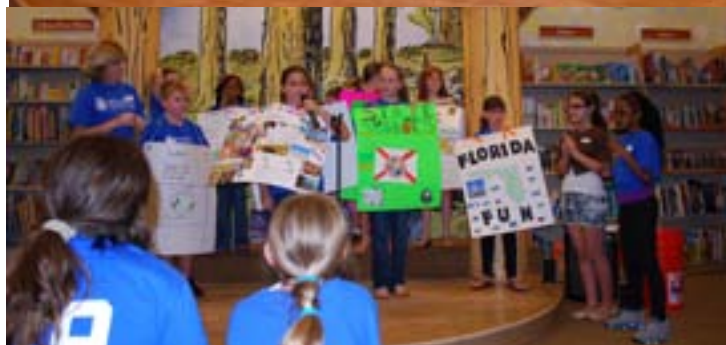
Above: We had a wonderful evening at our Barnes and Noble Bookfair! Students performed, parents smiled, and ACA was well represented in our community. Right: The MarineBio class made a special trip to the Miami Seaquarium.