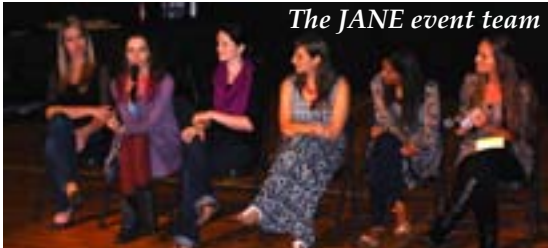
The JANE event team

A great day of discovery for young men, 7th-12th grade