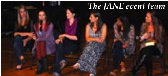
The JANE event team

A great day of discovery for young men, 7th-12th grade